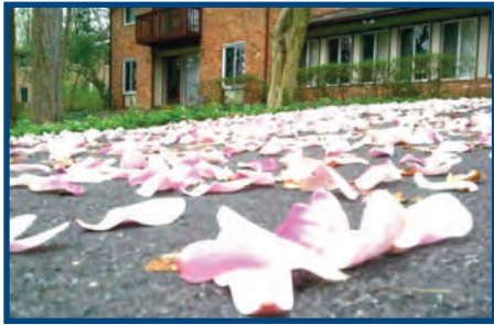
7911 PARK OVERLOOK DR $4,200 • RENT