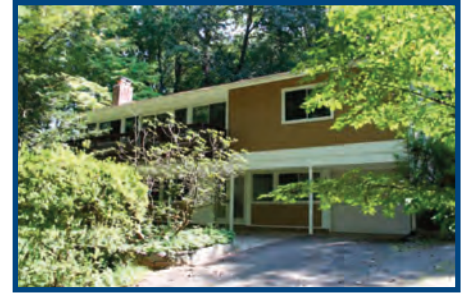
8309 FENWAY ROAD $925,000 • FOR SALE