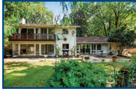
8226 STONE TRAIL DRIVE $925,000 • FOR SALE