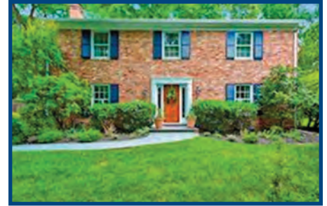
8013 LILLY STONE DRIVE $935,000 • SOLD