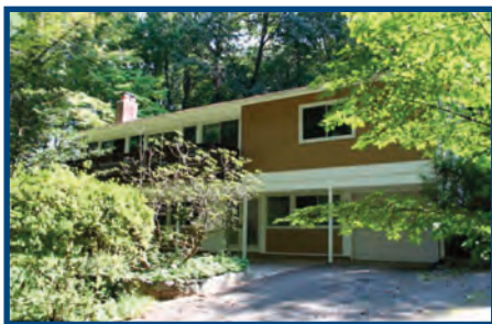
8309 STILL SPRING COURT $843,000 • SOLD