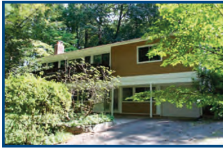
8309 FENWAY RD $3,800 • RENT