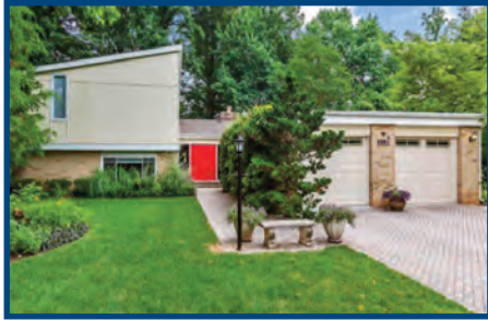
7005 BUXTON TERRACE $1,089,000 • FOR SALE