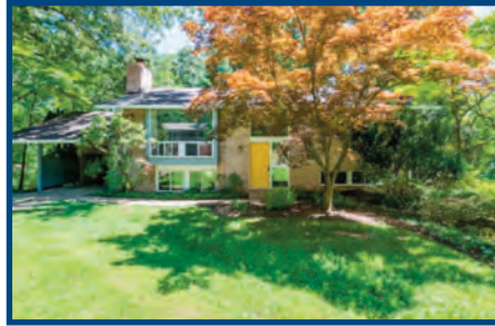
6805 PERSIMMON TREE $765,000 • SOLD