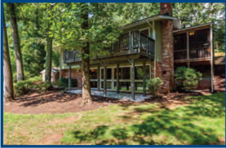
8213 HAMILTON SPRING $931,000 • SOLD