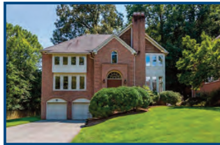
8104 TOMLINSON AVENUE $1,195,000 • FOR SALE