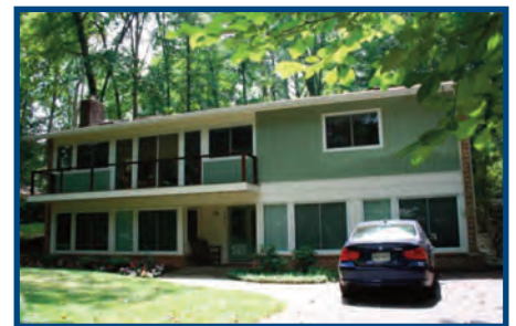
7511 HAMILTON SPRING ROAD $875,000 • SOLD