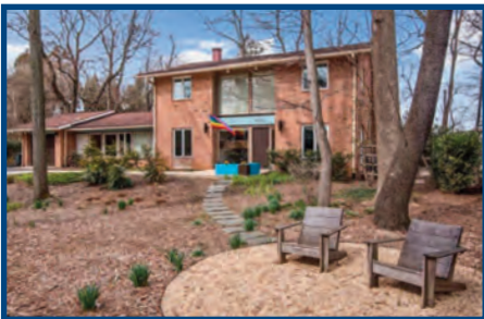
8020 FENWAY ROAD $1,292,500 • SOLD