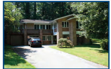
8120 HAMILTON SPRING ROAD $875,000 • RENT