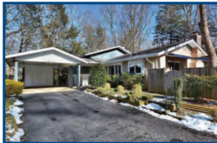
8320 FENWAY ROAD $925,000 • SOLD