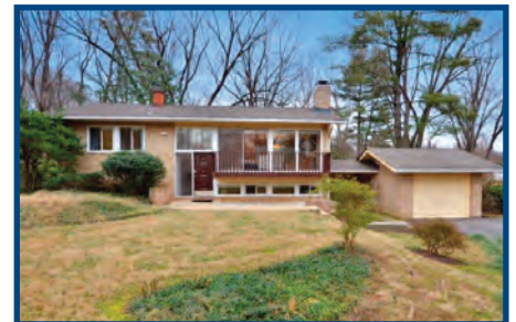
8011 FENWAY ROAD $915,000 • SOLD