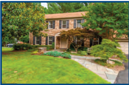
8016 THORNLEY COURT $965,000 • SOLD