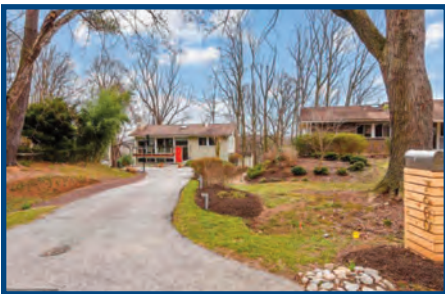
7600 HAMILTON SPRING $783,000 • SOLD