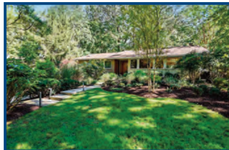
7510 HAMILTON SPRING ROAD $965,000 • CONTRACT