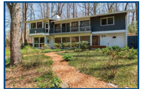
8204 HAMILTON SPRING COURT $989,000 • SOLD