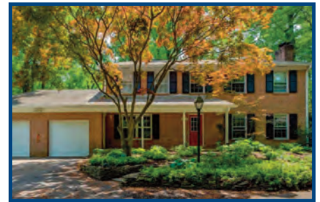
8028 LILLY STONE DRIVE $925,000 • FOR SALE