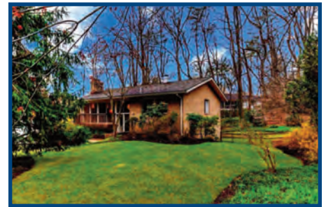
7904 HAMILTON SPRING ROAD $839,000 • SOLD