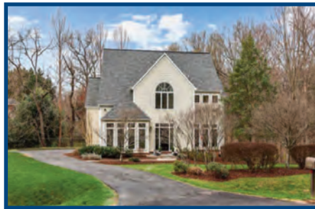
7924 LONGRIDGE COURT $1,150,000 • SOLD