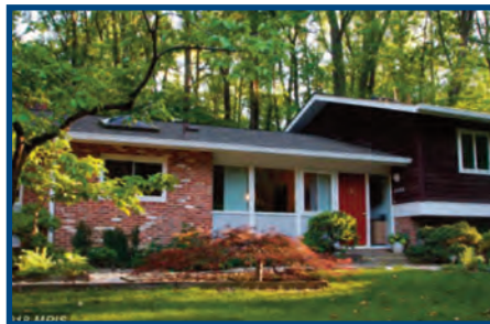
8408 PECK PLACE $1,034,000 • SOLD